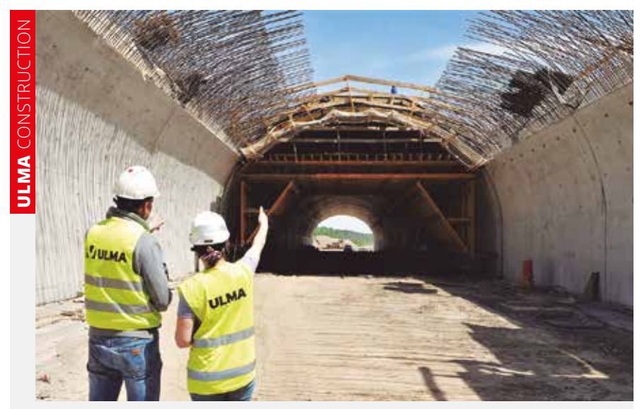
THE S3 MOTORWAY CONSTRUCTION PROJECT COMPRISES A NEW ROAD TUNNEL (TS-32), AROUND 320 M LONG, ON THE LEGNICA-LUBAWKA STRETCH NEAR GOSTKÓW, POLAND.